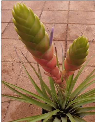
Tillandsia jalisco-monticola 'Pink Clone' grown by Adam Bodzioch

"In the early years of collecting, there were (and still are) many forms of Tillandsia fasciculata . We would keep the different forms or types, (not at all referring to the type specimen) separate by giving them a unique number, and some details about the form or type. This group of plants called Tillandsia fasciculata in Mexico, can vary quite a bit in different localities, and even vary on the same tree. We have Till. fasciculata Peach type, Till. fasciculata Yellow type, Till. fasciculata Candelabra type, etc.