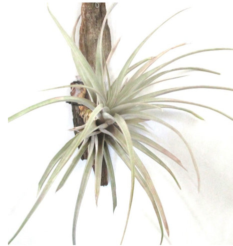
Tillandsia rihondoensis shown by Dave Boudier