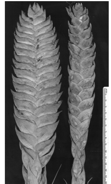
Tillandsia jalisco-monticola left Tillandsia magnispica right

We do know that we were growing many plants in Australia called Till. jalisco-monticola which were better identified as Till. magnispica and no doubt there are others that will need to be adjusted. If you are growing T446 then Tillandsia jalisco-monticola 'Pink Clone' is the best name to use because it agrees with Bird Rock Tropicals' current interpretation. Regrettably, this name is not acceptable as a cultivar name under the ICNCP rules, so cannot be registered.