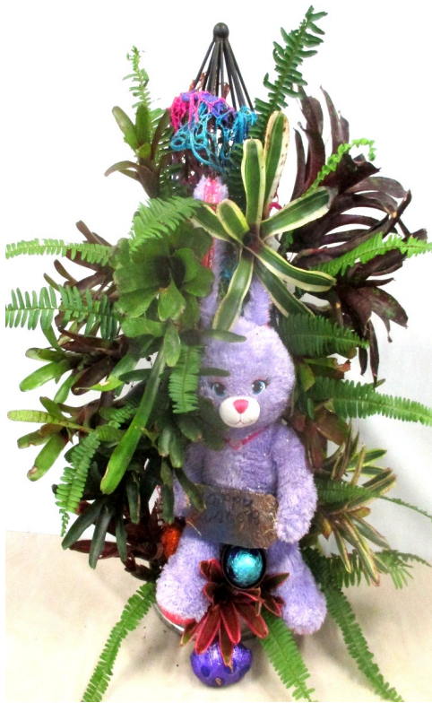
'Happy Easter' equal 1st Decorative Keryn Simpson