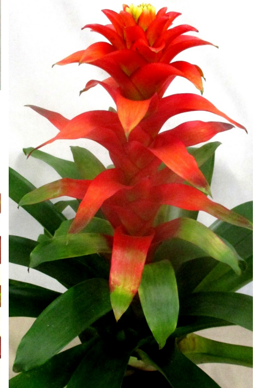
Guzmania 'Grado' shown by Keryn Simpson