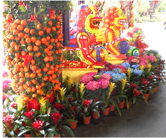
taken at Singapore Gardens and the Airport