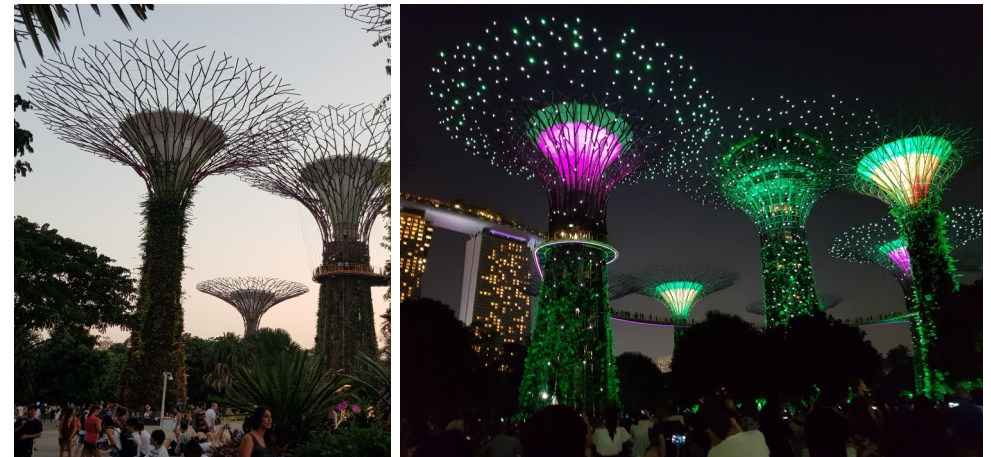
taken at Singapore Gardens and Singapore Zoo