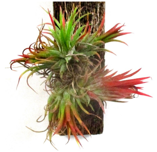
Tillandsia 'Fuego' shown by Gary McAteer