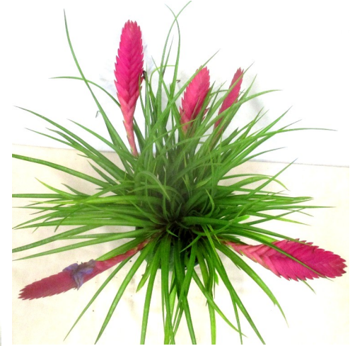
Wallisia cyanea shown by Keryn Simpson