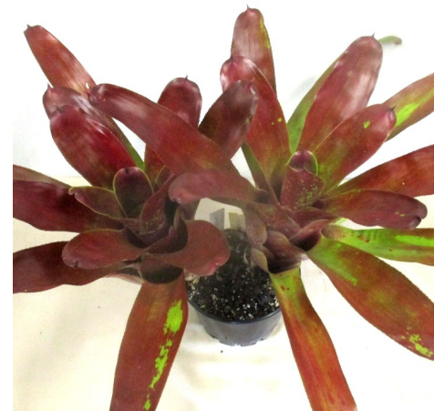
Neoregelia 'Carnival Queen' shown by Coral McAteer