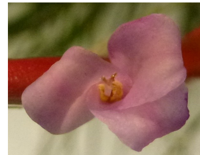
Tillandsia dura shown by Helen Clewett