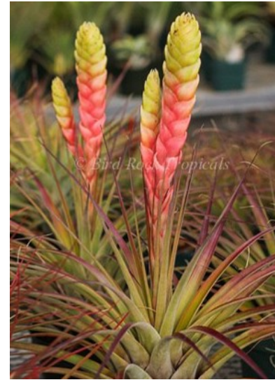
Tillandsia jalisco-monticola 'Pink Clone' grown by Pamela Koide-Hyatt

The plant referenced here is what we labelled Tillandsia fasciculata ( lampropoda type). T446. The reason for this name was that it usually only had a single spike, sometimes double and they present upright and close to each other. The inflorescence was colored pink (salmon-pink) to light green-yellow, and compressed or flattened with a little bit of white lepidote coating. The shape and colouring of the inflorescence reminded me of Tillandsia lampropoda . I knew that it was not Till. lampropoda , it was also different than what we were calling Tillandsia jalisco-monticola , which was more red, green and yellow with more inflated, or fatter spikes.