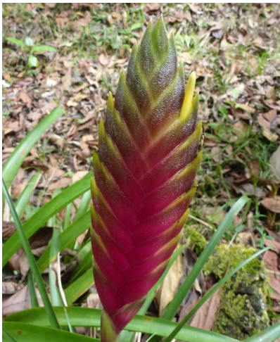
Tillandsia lampropoda Chiapas, Mexico, R. Little

The plant referenced here is what we labelled Tillandsia fasciculata ( lampropoda type). T446. The reason for this name was that it usually only had a single spike, sometimes double and they present upright and close to each other. The inflorescence was colored pink (salmon-pink) to light green-yellow, and compressed or flattened with a little bit of white lepidote coating. The shape and colouring of the inflorescence reminded me of Tillandsia lampropoda . I knew that it was not Till. lampropoda , it was also different than what we were calling Tillandsia jalisco-monticola , which was more red, green and yellow with more inflated, or fatter spikes.